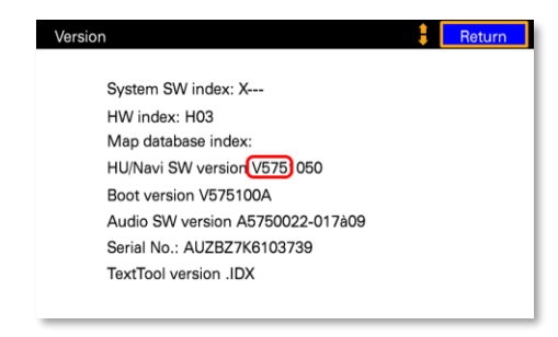
V575 HU/Navi SW = 193 PU unit