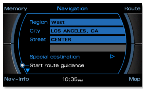
192 = Solid text box and frame border