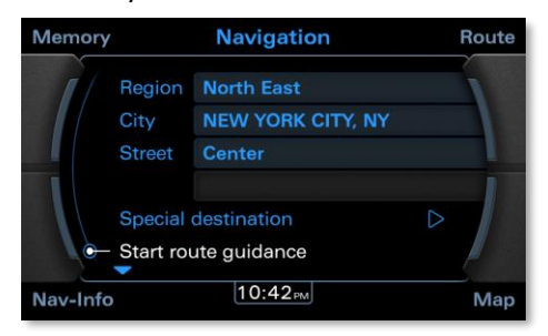
193 PU = Graduated text box and border